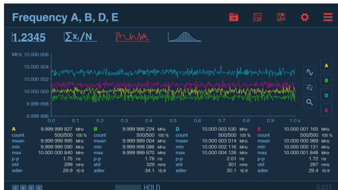
View 4 signals simultaneously on screen. 4 instruments in one!

Measured values are presented as both numerics and graphics. The graphical presentation of results (distribution, trends etc.) gives a better understanding of the nature of jitter. It also provides you with a much better view of changes vs time, from slow drift to fast modulation. The same data set can be viewed in Numerical, Statistics, Distribution and Time-line views. It is very easy to capture and toggle between views of the same data set.