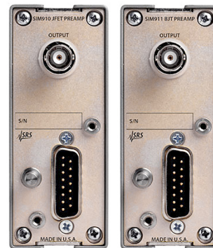
SIM910 &amp; SIM911 rear panels