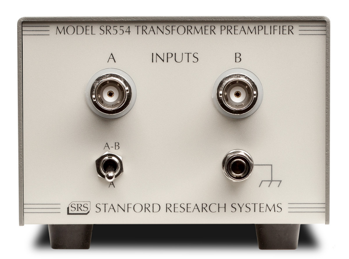
SR554 Front Panel